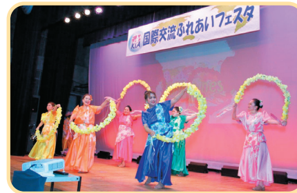
Picture of 2021 Festival

Food tickets Available at the KIA office from Sep 1 (Fri). 500 yen/ticket (Foods, drink, and a lottery ticket)