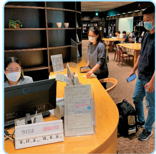
▲ As part of NAKAMA 2 we made library cards.

Application Please come to the Komaki International Association (KIA) with the fee.