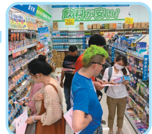
▲Shopped at the pharmacy during the June NAKAMA event

Application Please come to KIA with the fee.