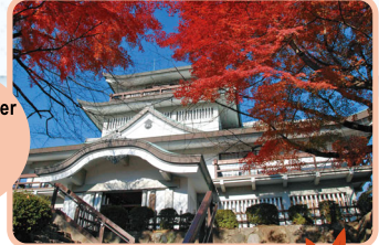
Castle Tower with Autumn Leaves