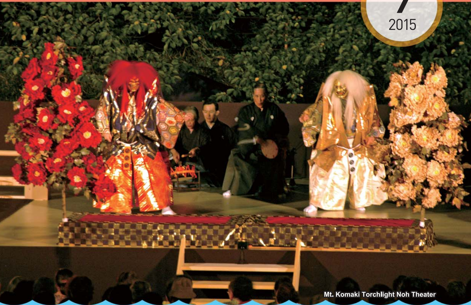
Mt. Komaki Torchlight Noh Theater