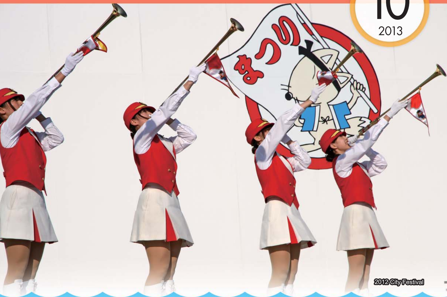
2012 City Festival