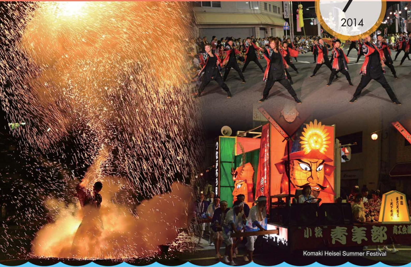
Komaki Heisei Summer Festival