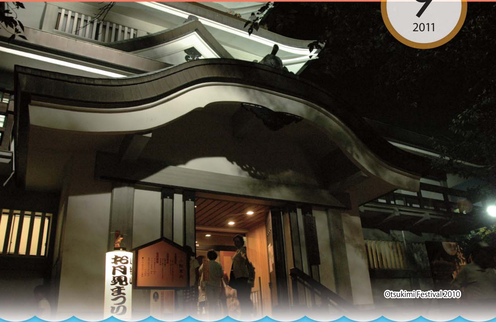
Otsukimi Festival 2010