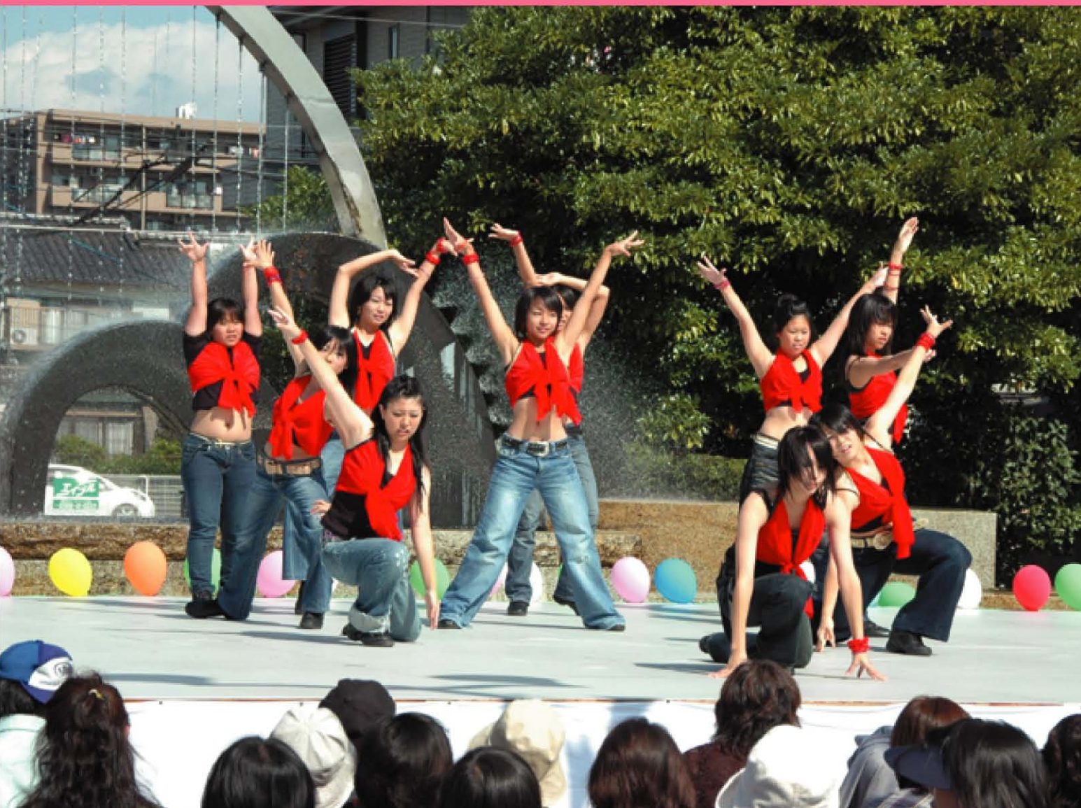
The 28th Komaki Citizens' Festival (Dance Mix)

Foreigner population 9,644 《 As of September 1, 2008 》