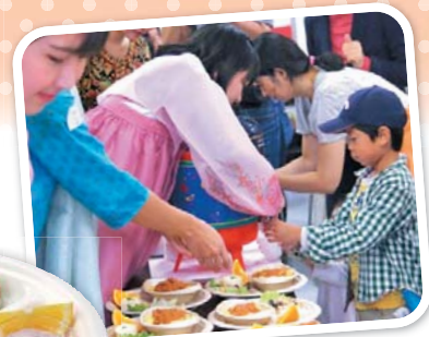
◀ 2018 Menu Mexican Tacos and more

Inquiries Komaki International Association (KIA) TEL.0568-76-0905