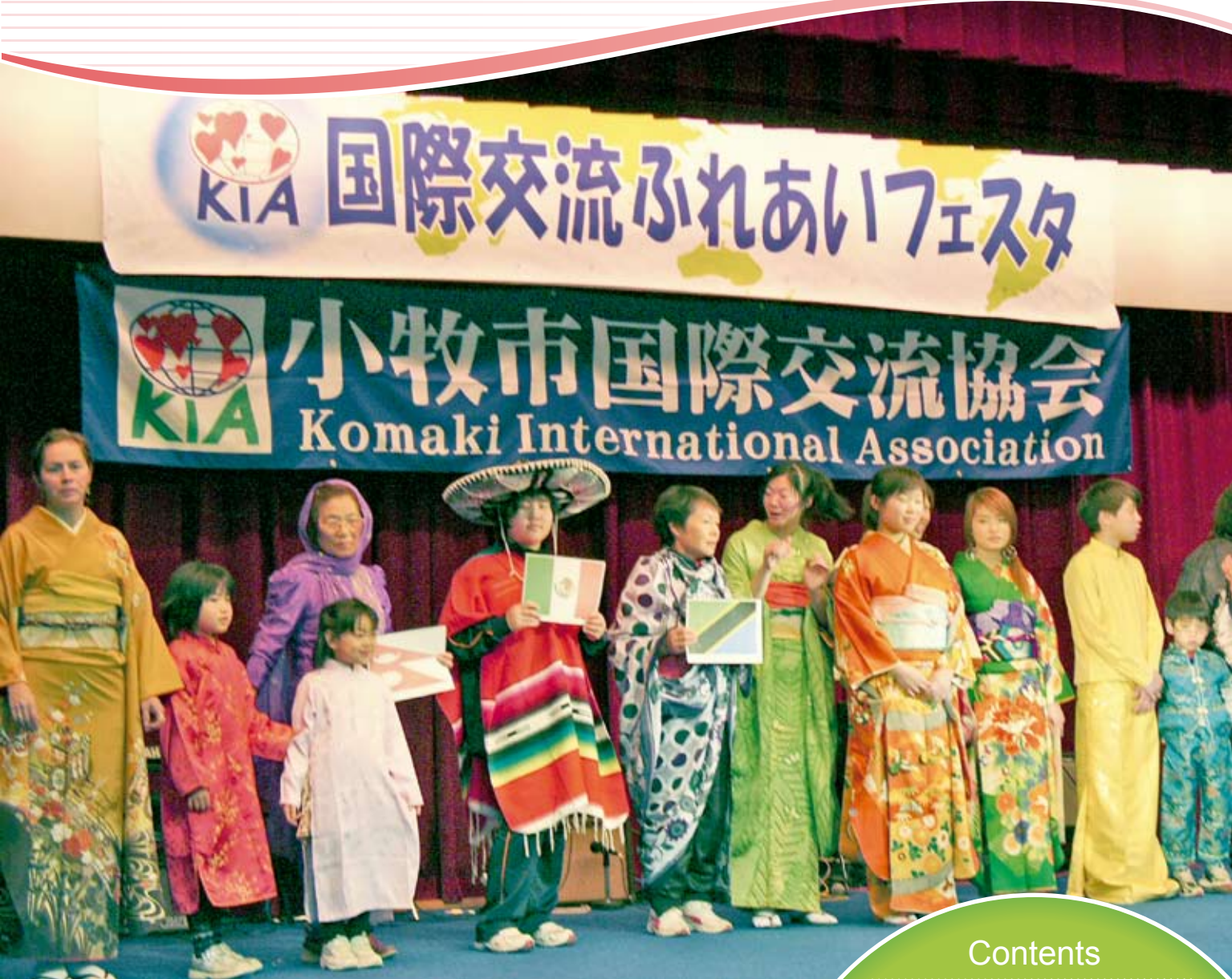
International Exchange Festival (See P.2 for details)