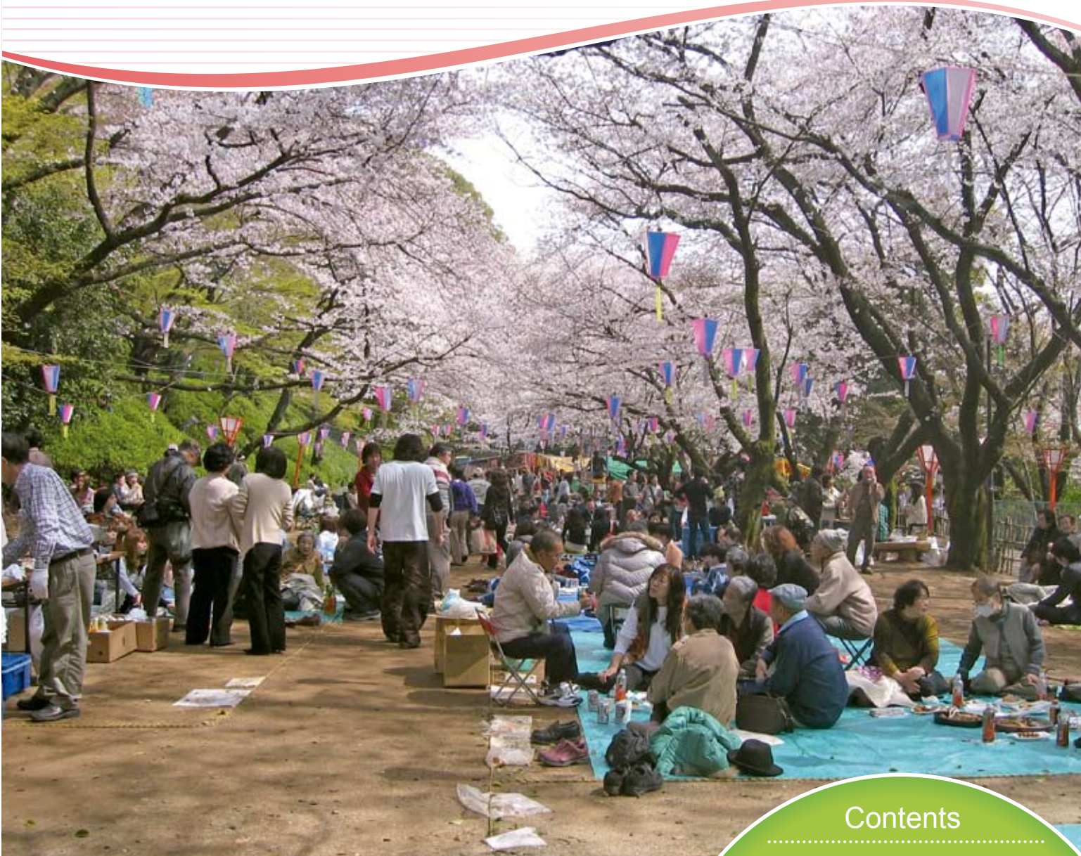
Mt. Komaki Cherry Blossom Festival (See P.2 for details)