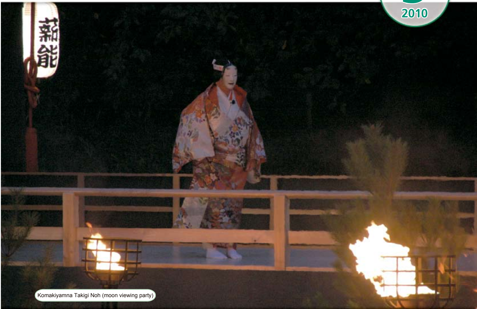
Komakiyamna Takigi Noh (moon viewing party)