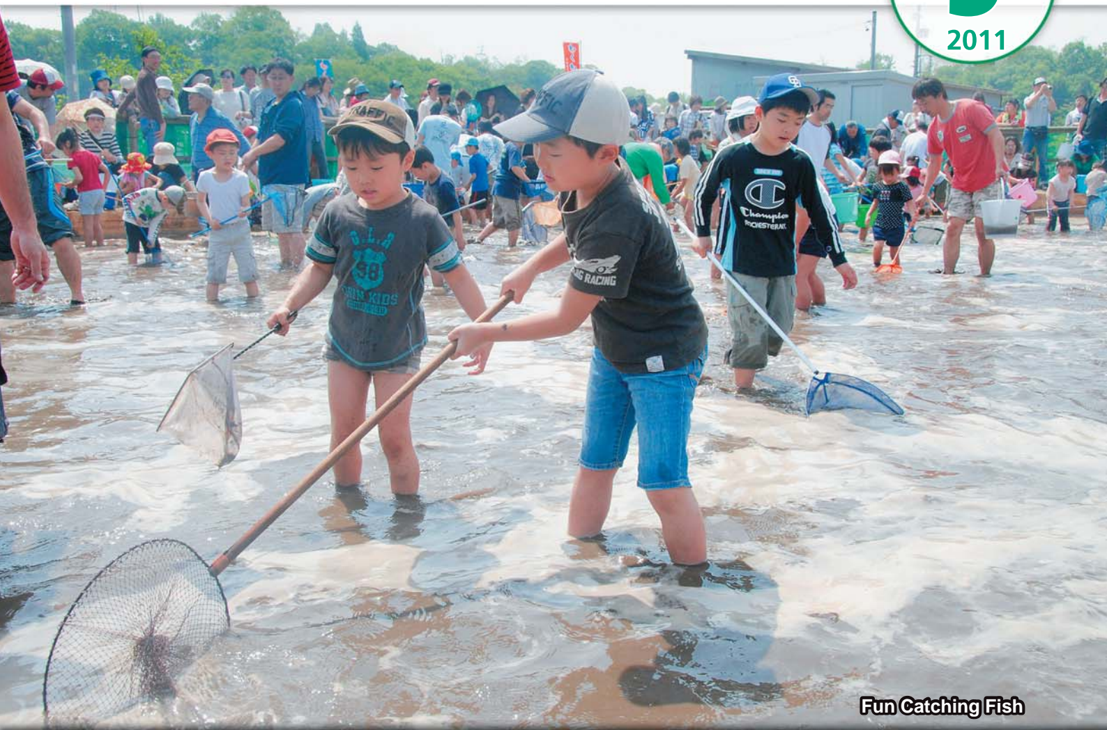
Fun Catching Fish