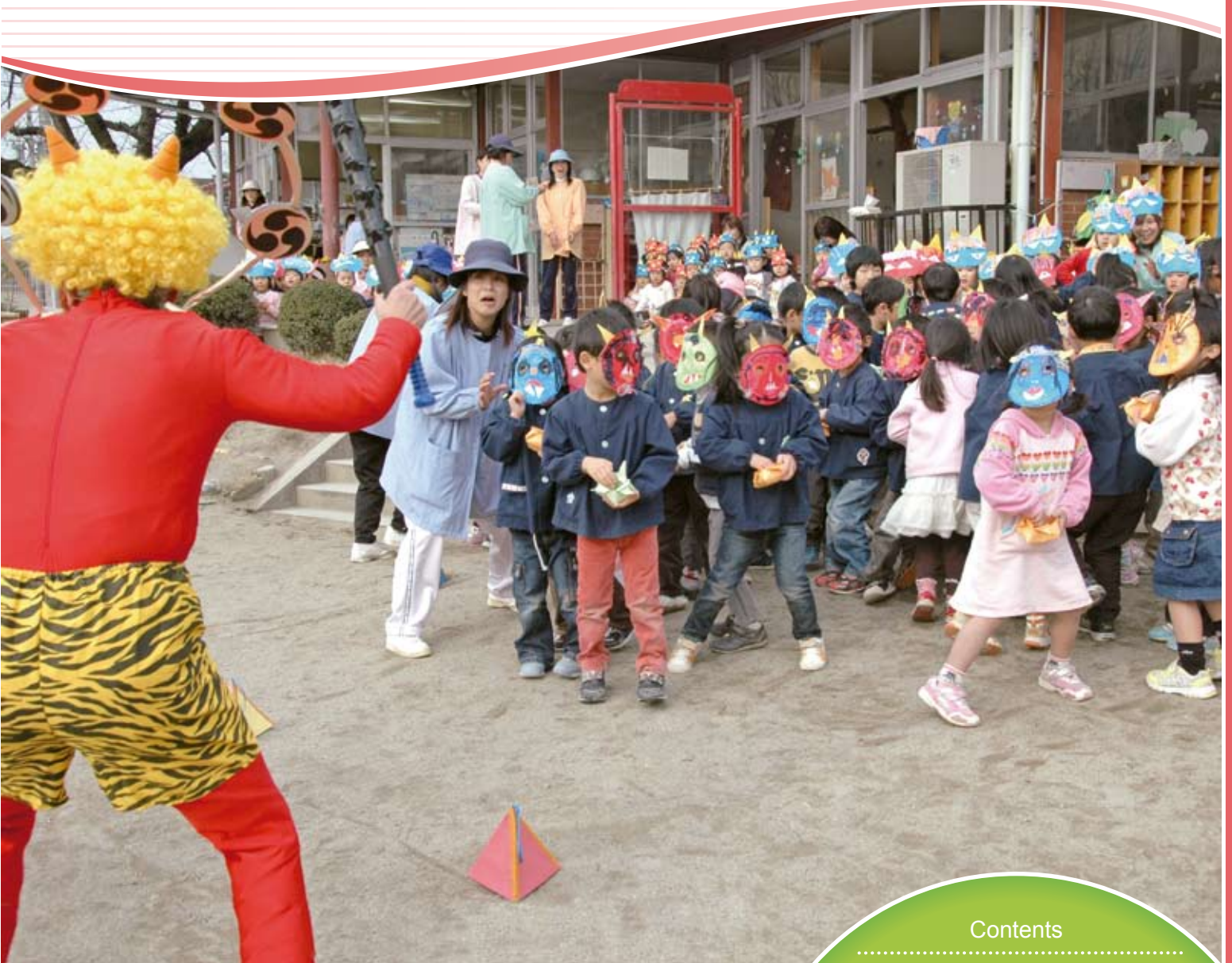
Setsubun (end of winter) bean-throwing (See P.3 for details)