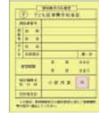
A "certificate" is shown above.

When injuries are acquired under the control of schools (or nursery schools)! * Please obtain a certificate, a medical condition statement and a receipt attachment form from the school (nursery school).