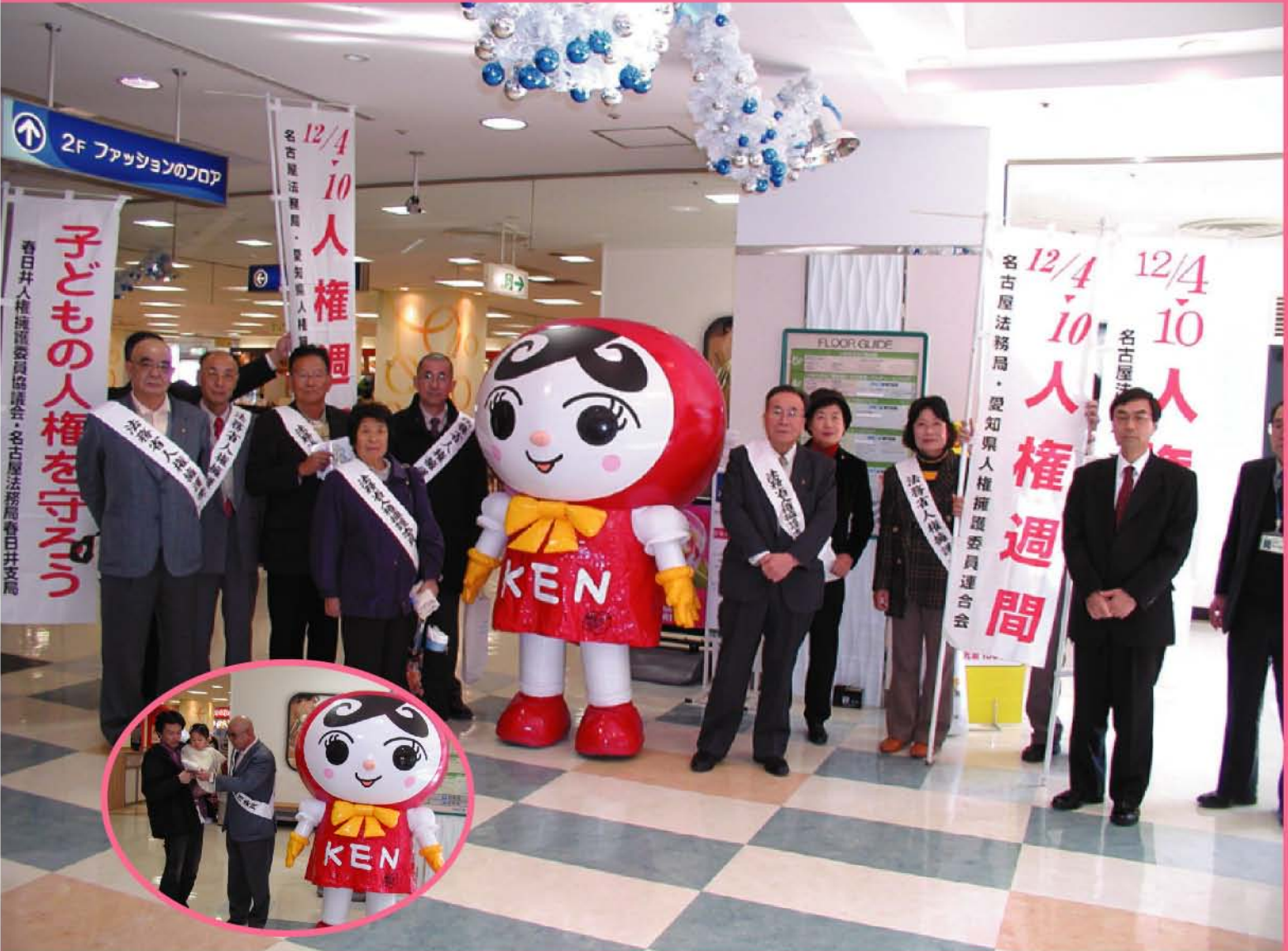
Edification during Human Rights Week (December 4 to 10) at Heiwado

Komaki City population 153,903 Foreigner population 9,635 《As of December 1, 2008》