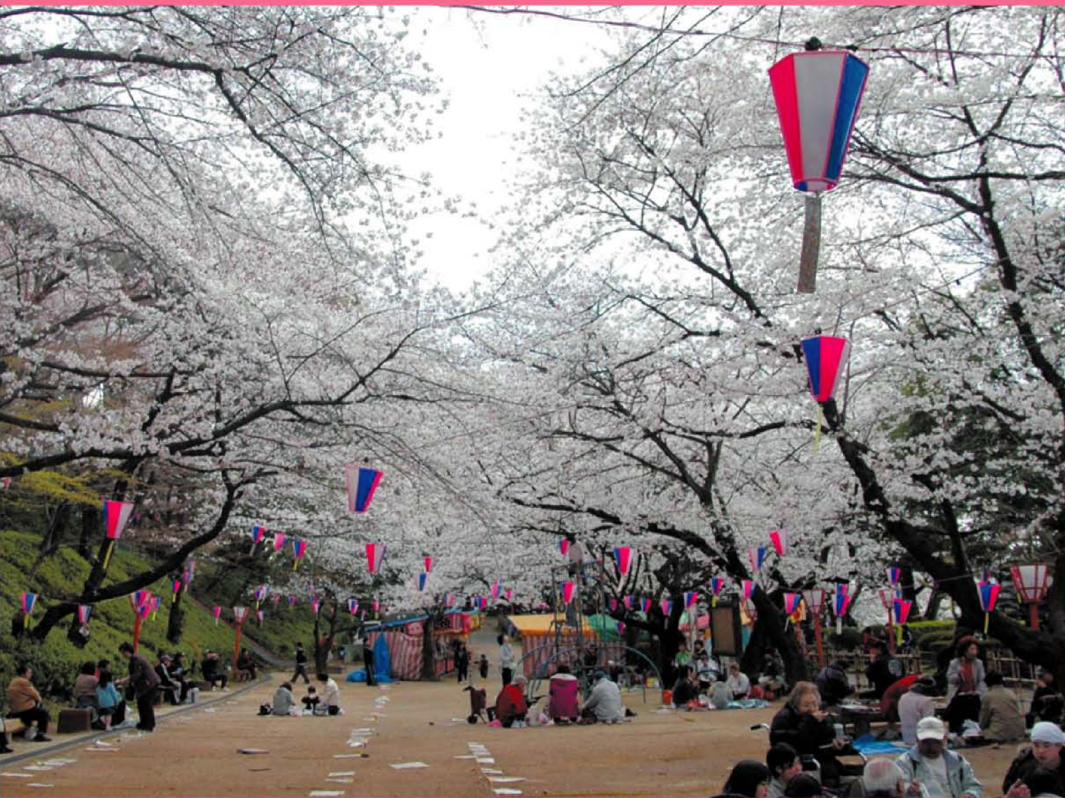
Komakiyama Sakura (Cherry Blossom) Festival

Komaki City population 153,702 Foreign resident population 9,445 《 As of March 1, 2009 》