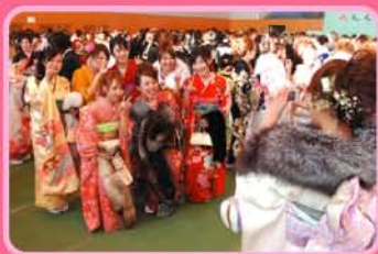
2009 Komaki City Coming of Age Ceremony

(Refer to p. 3 for more information on viewing the first sunrise of the New Year)