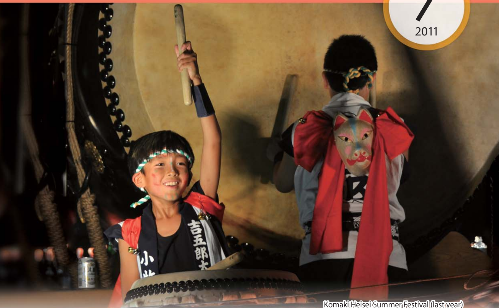
Komaki Heisei Summer Festival (last year)