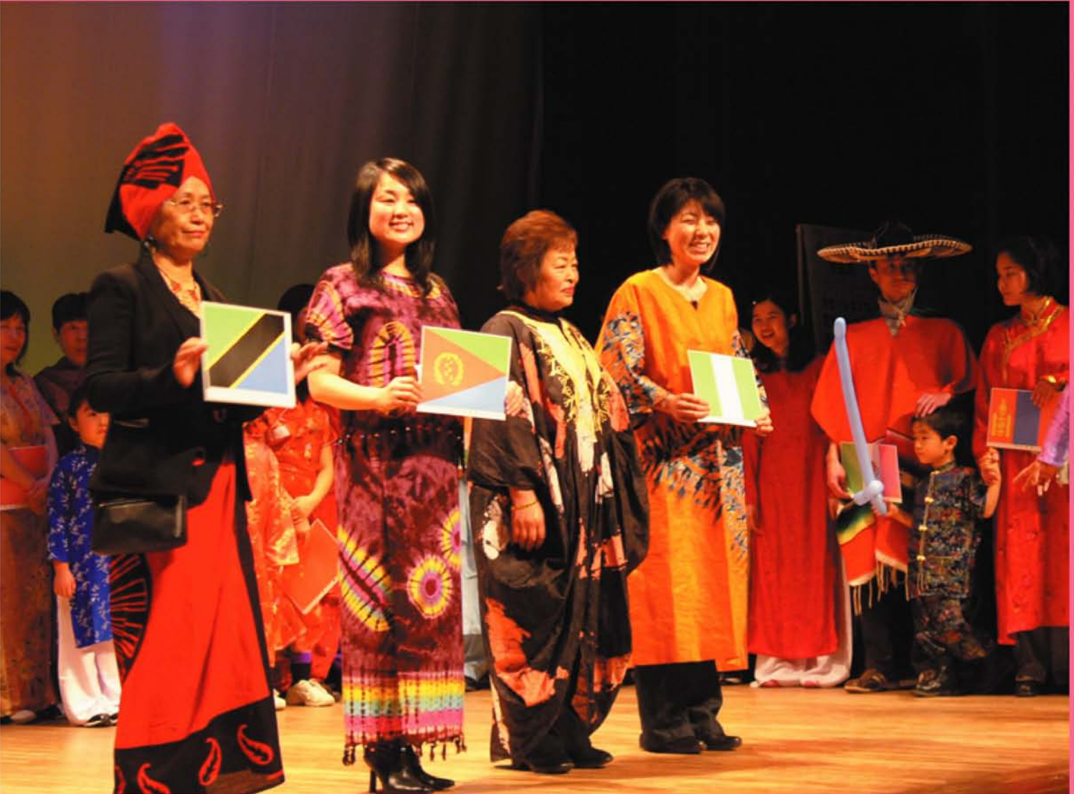
International Fair in Komaki City

Komaki City population 153,859 Foreigner population 9,657 《As of August 1, 2008》