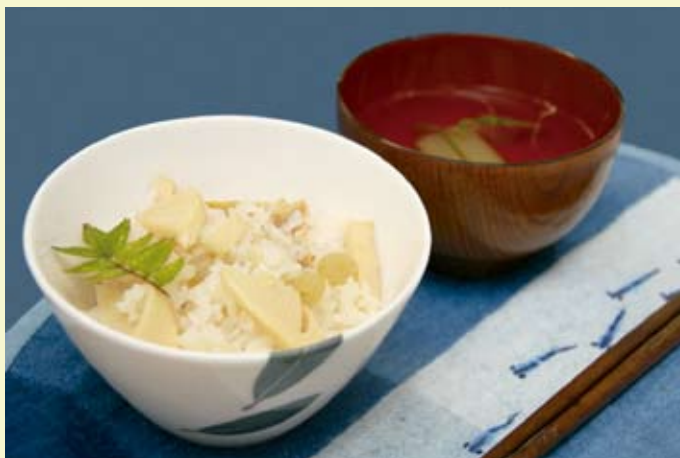
Recipe provided by: School Lunch Nutrition Group