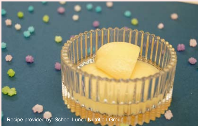
Recipe provided by: School Lunch Nutrition Group

Tips When boiling the peaches, remember to skim the scum off the top of the water.