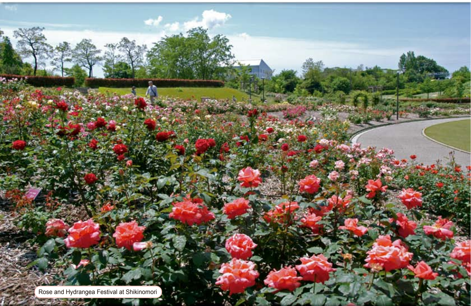
Rose and Hydrangea Festival at Shikinomori