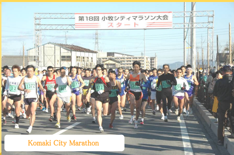
Komaki City Marathon

Toshikoryu sec. City Hall (都市交流係) TEL: 0568-76-1173 ● 月～金 ● 8:30～17:15