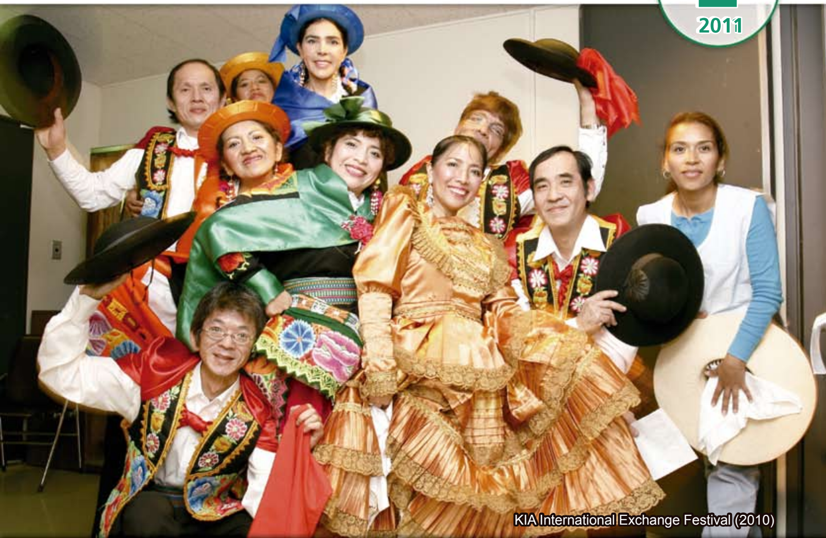
KIA International Exchange Festival (2010)