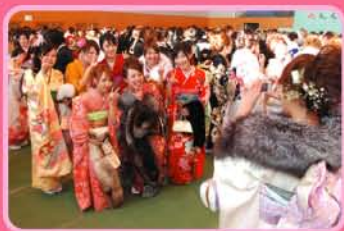
2009 Komaki City Coming of Age Ceremony

(Refer to p. 3 for more information on viewing the first sunrise of the New Year)