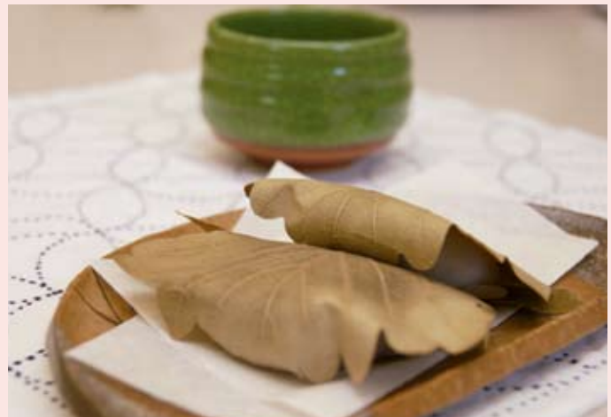
Recipe provided by: School Lunch Nutrition Group