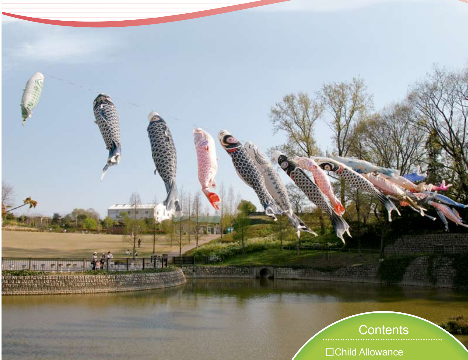
Koinobori (Carp-shaped streamer) in Shikinomori